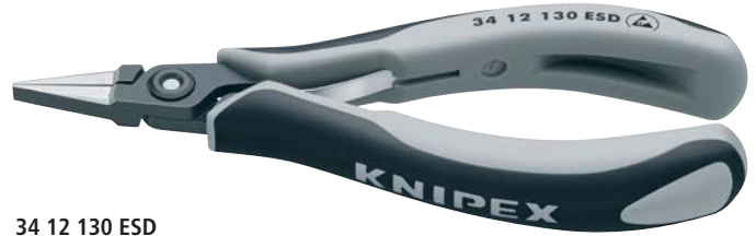
34 12 130 ESD ⚡️ ✳️ ◻️ ◻️ ◻️ ◻️ ◻️